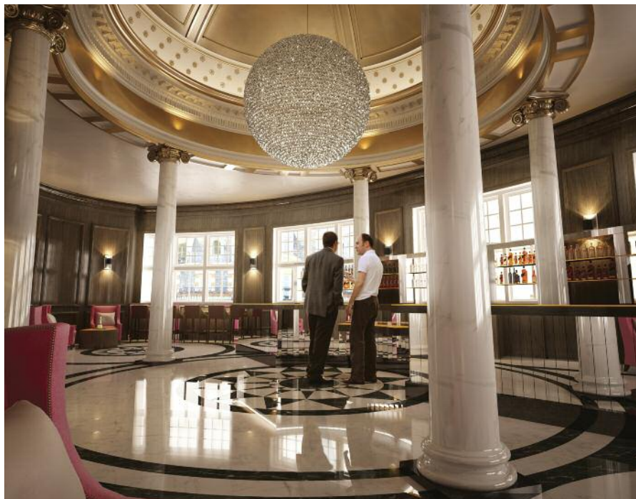
The £20m restoration of the Grand Central Hotel is one of the many striking new hotel developments in the IFSD.

And, last year, the IFSD set up a special awards programme to recognise the very best talent emerging from the