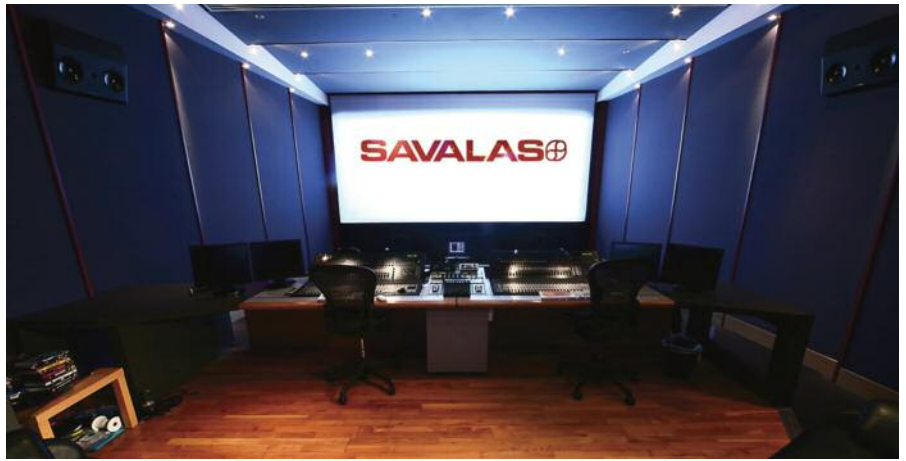
The Savalas studio at Film City Glasgow features the first Dolby Premier studio in the UK

The partners behind Creative Clyde are determined to create the perfect environment for creative companies to locate and grow. So, a huge emphasis has been placed on getting the infrastructure right. This includes purpose-built high quality accommodation and high bandwidth connectivity. Together with favourable